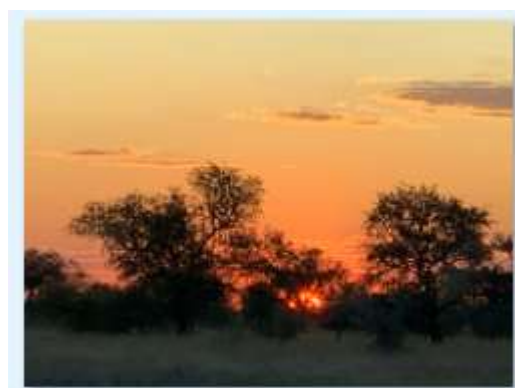
Final sunset on tour