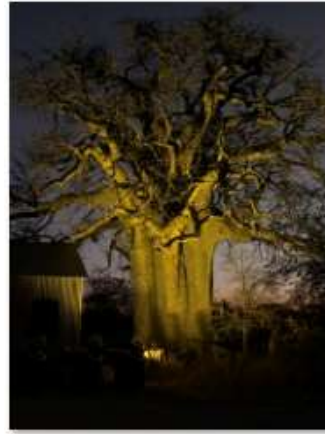
Baobab tree at night