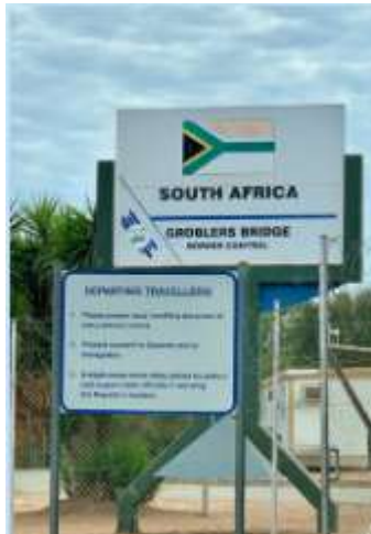
Final Border Post

Mid-afternoon the tour will end where it has started 14 days earlier.