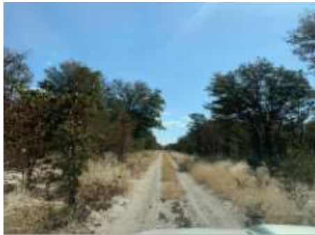
'Lekker' Jeep track

We overnight on the bank of the river at a historical venue – from the days of tough buffalo and elephant hunters. The view from the observation deck, with something cold in the hand, will mesmerize you.