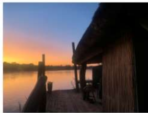
Sunrise over the river