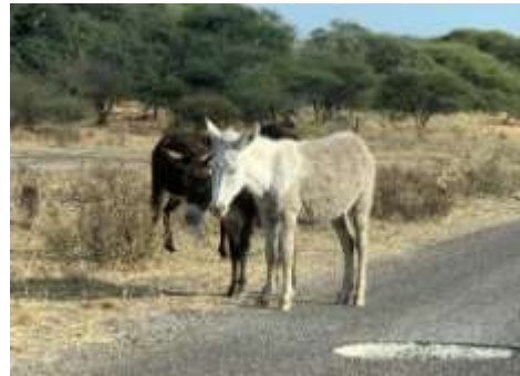
Many of these to be seen