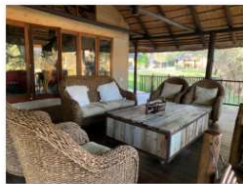
First night's accommodation