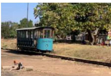
Vic Falls' tram