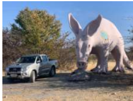
Close to Planet Baobab