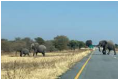
Pedestrians crossing the road

We overnight in a lodge in 'the middle of nothing', on a peninsula, on a river bank!