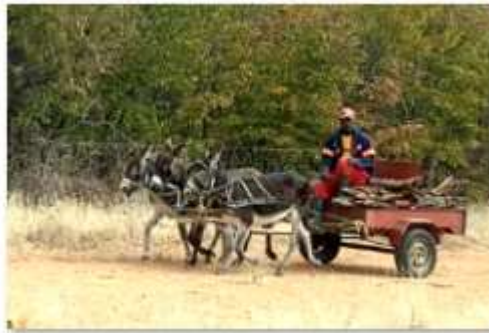
Kalahari Ferrari in the Bushveld