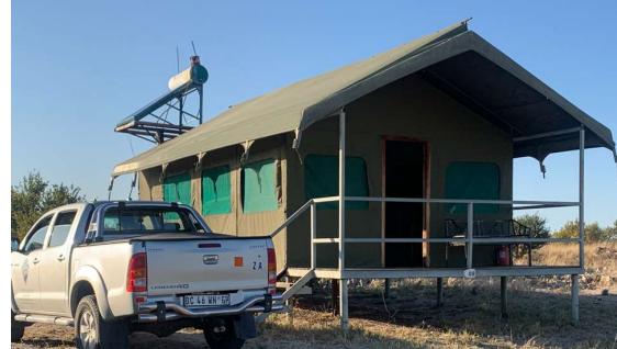
Accommodation close to the elephants