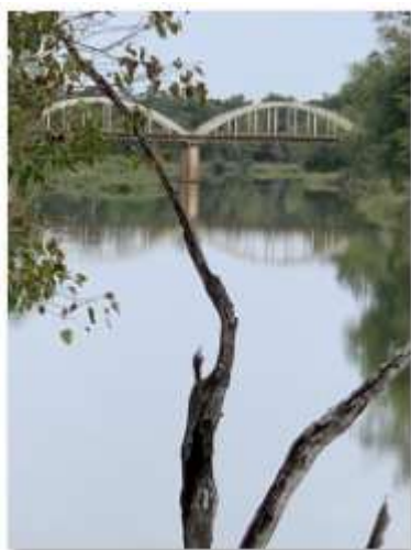
Groblersbrug over the Limpopo River