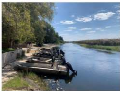
Ready for sunset cruises

We overnight at the same venue and again a pit fire will make you feel at ease. The clear night sky will give you the opportunity to enjoy the stars.